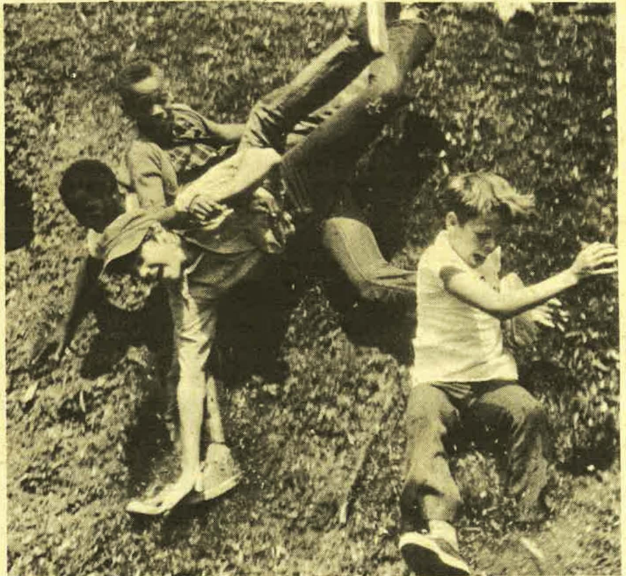
Aside from learning, the aim is on just having fun.