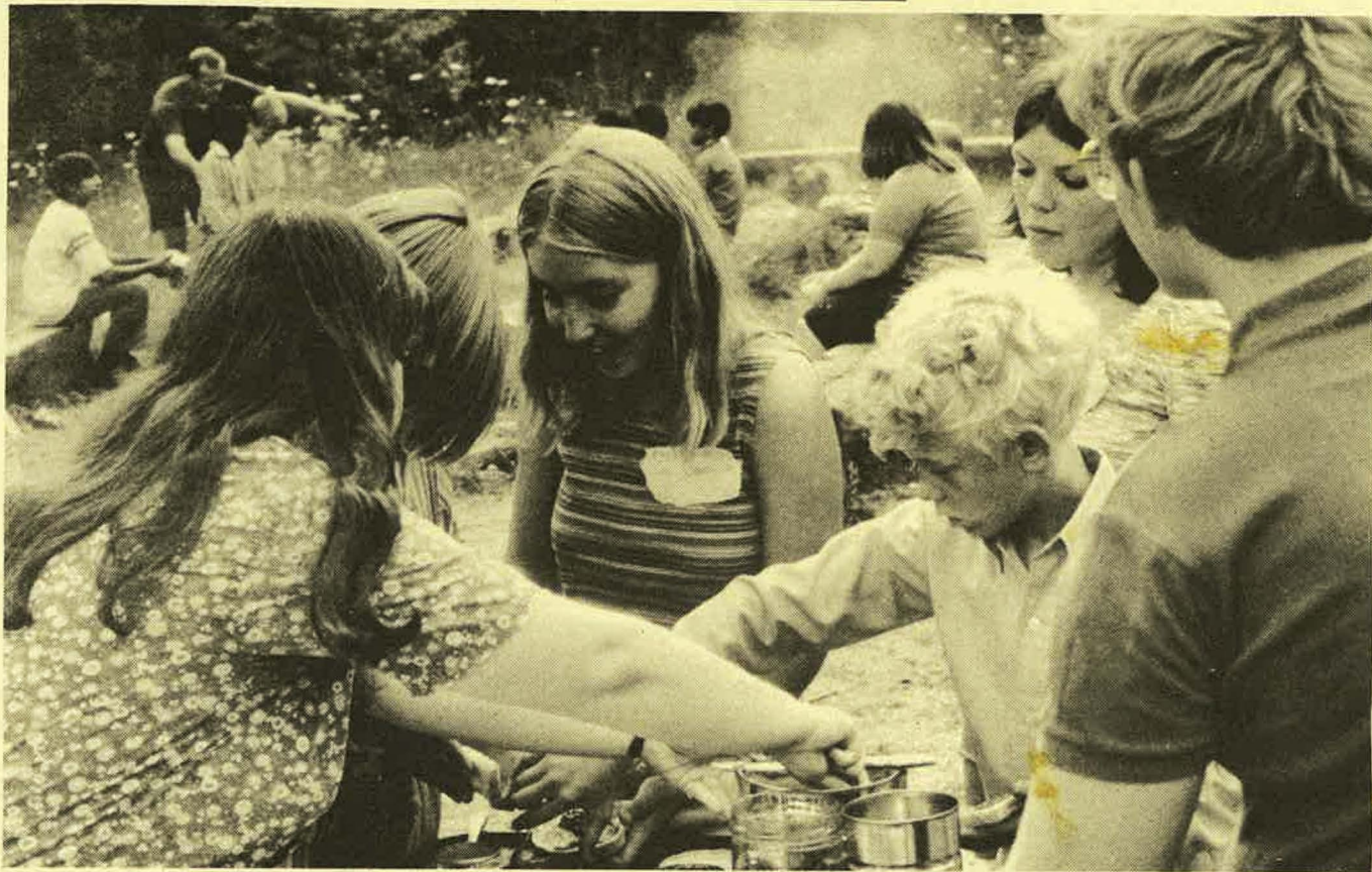
Some 300 youngsters from Lansing's low-income neighborhoods had a reprieve from the city heat this summer, thanks to a program organized by an MSU graduate student and 4-H volunteer. A story and picture are on page 3.

Winter term registration will be Jan. 3 and 4, with classes beginning on Jan. 5.