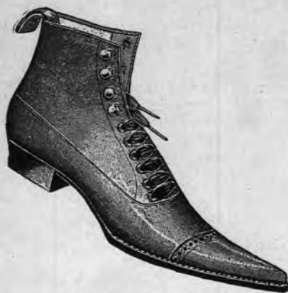
THE NEW STILETTO.