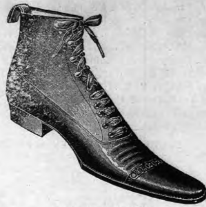
THE NEW LENOX.

We wish to call your attention to the two latest and handsomest Shoes brought out this season—the new Stiletto and new Lenox—as illustrated above. Made in Patent Leather, Vici Kid, Fine Calf, Wine, Russet and Russia Leather, at prices ranging from $3.00 to $5.00 a pair. Kindly allow us to show you these goods when you are in need of shoes.