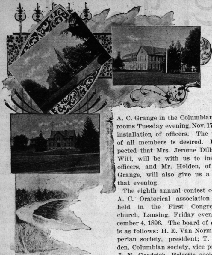
At the College.