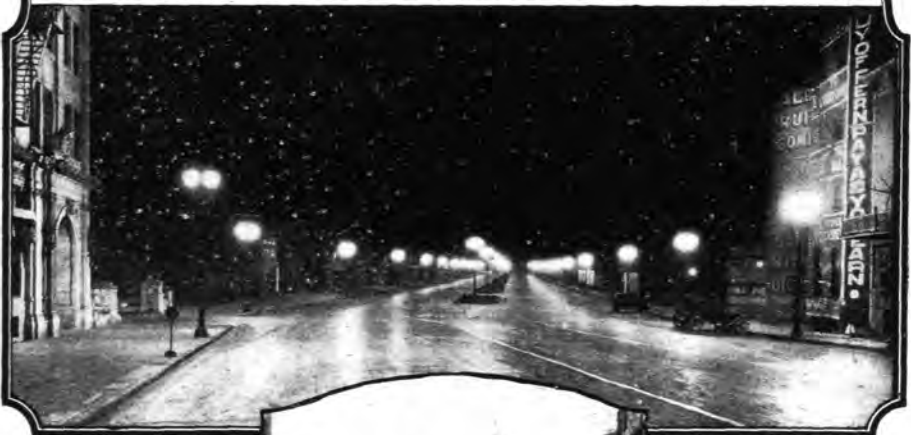
1925—As it is today! Erie Boulevard, a splendidly lighted and paved main thoroughfare in Schenectady