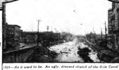
1919—As it used to be. An ugly, divided stretch of the Erie Canal