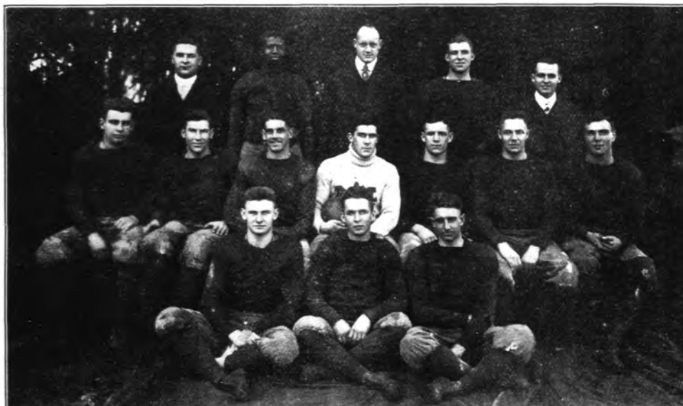
A TOWER OF MEMORIES CENTER ABOUT THIS TEAM OF '13