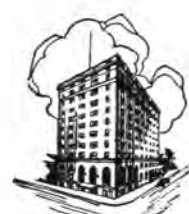
LYCOMING Williamsport, Pa.