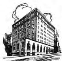
BETHLEHEM Bethlehem, Pa.