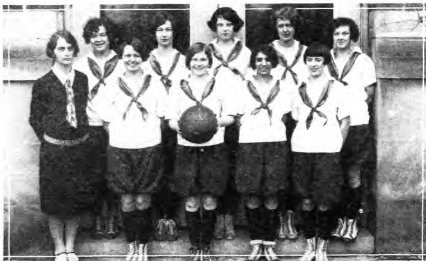
Class of '27 Wins Interclass Basketball Laurels of 1926