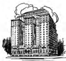
ROOSEVELT New York