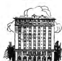
SAVANNAH Savannah, Ga.