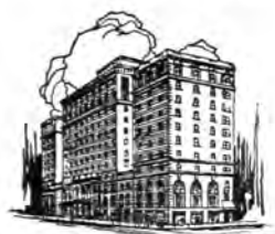
MOUNT ROYAL Montreal