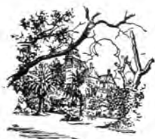
CLAREMONT Berkeley, Calif.