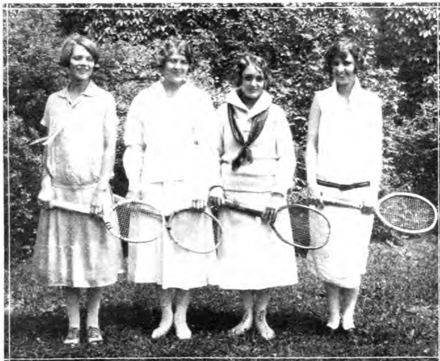
Co-ed Varsity Tennis Team of 1925

The Union production this year will take the form of a musical comedy review. The manuscript to be used is the same that came through successfully last year at the University of Pennsylvania, entitled "That's That". The date has been set for Farmers' Week, Feb. 4 and 5. Further action on the production now awaits the O. K. of the faculty.