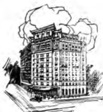
SAINT PAUL St. Paul