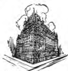
WALDORF-ASTORIA New York