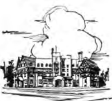
URBANA-LINCOLN Urbana, Ill.