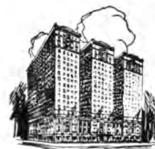
BENJAMIN FRANKLIN Philadelphia