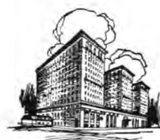
BILTMORE Los Angeles