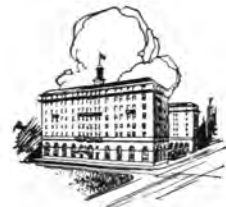
OAKLAND Oakland, Calif.