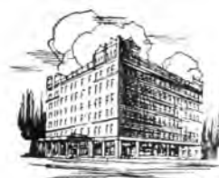
LINCOLN Lincoln, Neb.