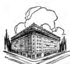
PALACE San Francisco