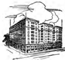
MULTNOMAH Portland, Ore.