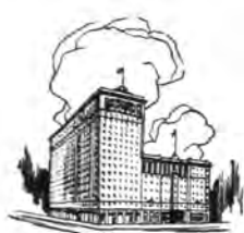
KING EDWARD Toronto