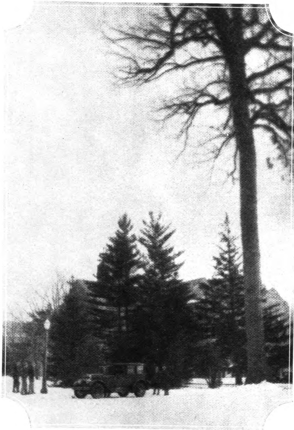
The Towering Oak Still Stands Sentinel Along the Campus Front