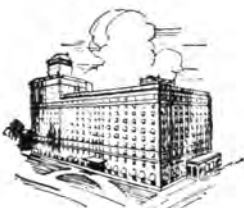
CORONADO St. Louis