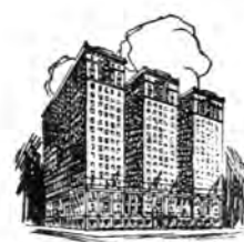
BENJAMIN FRANKLIN Philadelphia