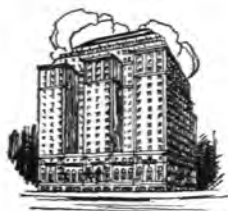
ROOSEVELT New York