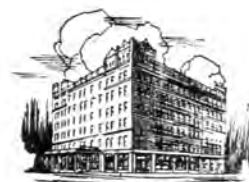
LINCOLN Lincoln, Neb.