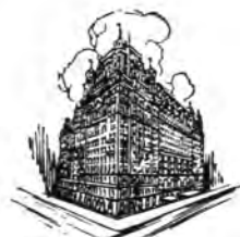
WALDORF-ASTORIA New York