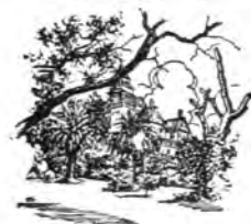
CLAREMONT Berkeley, Calif.