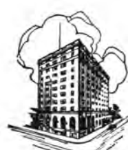
LYCOMING Williamsport, Pa.