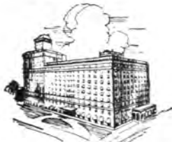
CORONADO St. Louis