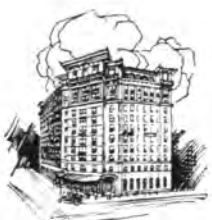
SAINT PAUL St. Paul