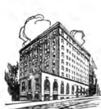
BETHEHEM Bethlehem, Pa.