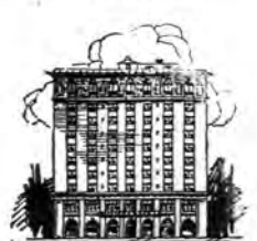
SAVANNAH Savannah, Ga.