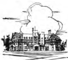
URBANA-LINCOLN Urbana, Ill.