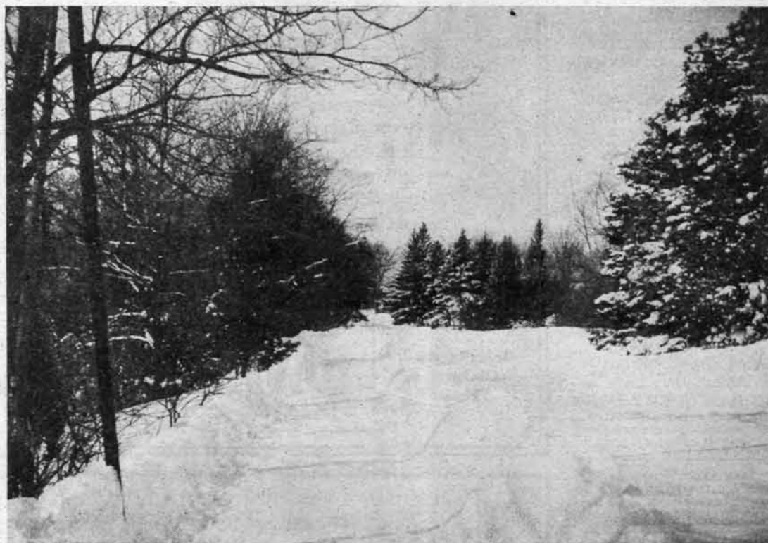
SCENE ON THE CAMPUS.

Published by The MICHIGAN AGRICULTURAL COLLEGE ASSOCIATION East Lansing, Michigan