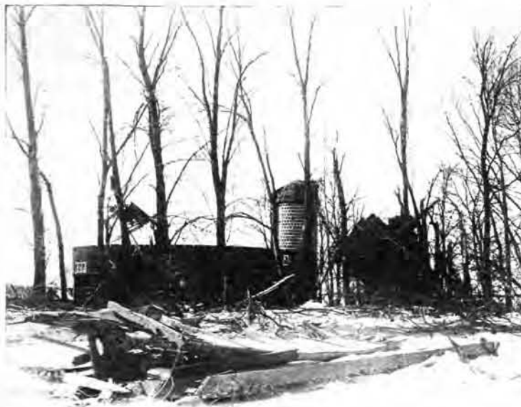
Natco Imperishable Silo standing after tornado had destroyed barn.