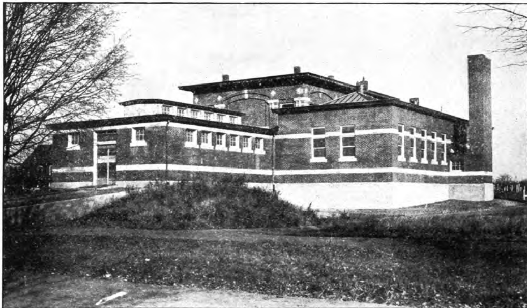
THE NEW VETERINARY BUILDING.

Published by The MICHIGAN AGRICULTURAL COLLEGE ASSOCIATION East Lansing, Michigan