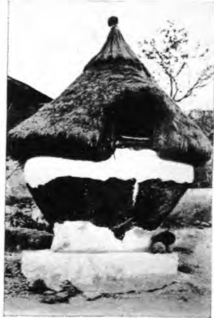
A Primitive Silo in Mexico.