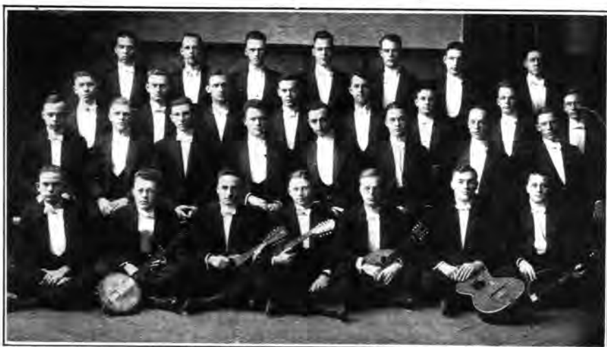
GLEE AND MANDOLIN CLUB.