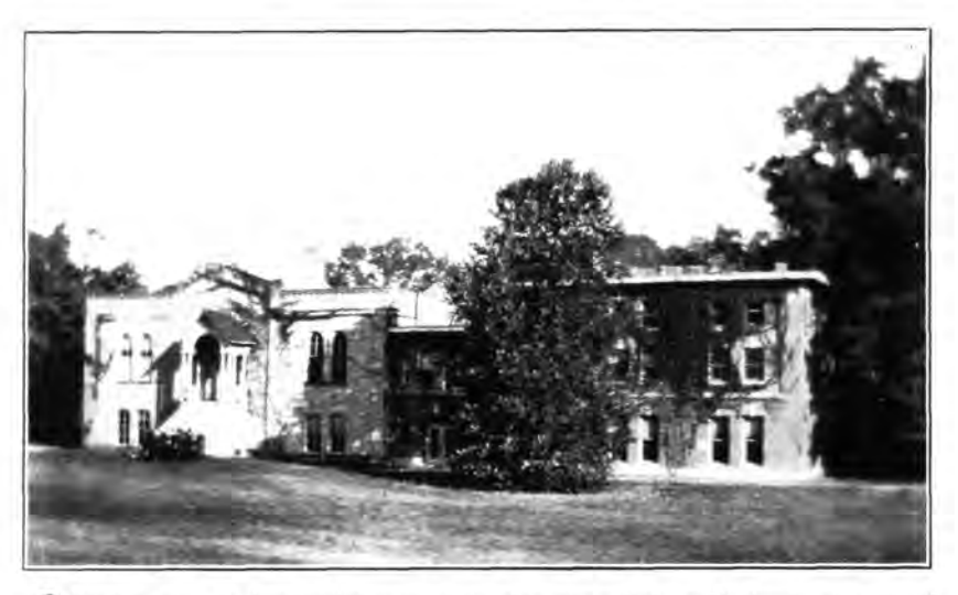
Of the present physics department headquarters it is said the west unit of the building built of white brick construction was erected in 1871. Being added to from time to line it was one of the oldest structures devoted to chemical instruction on this continent.

The building has been much improved by remodeling. A new entrance has been constructed at the east side and the north wing. A concrete floor has been installed in one of the store rooms and the group of three storerooms on the main floor have been made level.