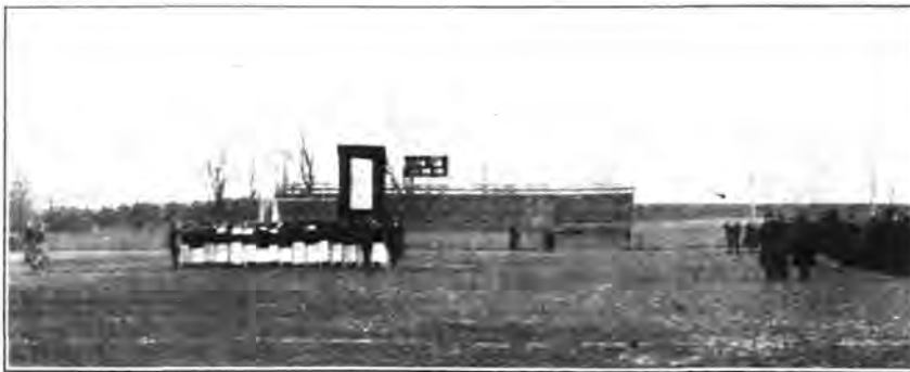
Unfurling The Service Flag