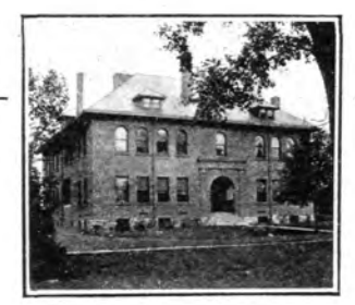
THE FORESTRY BUILDING