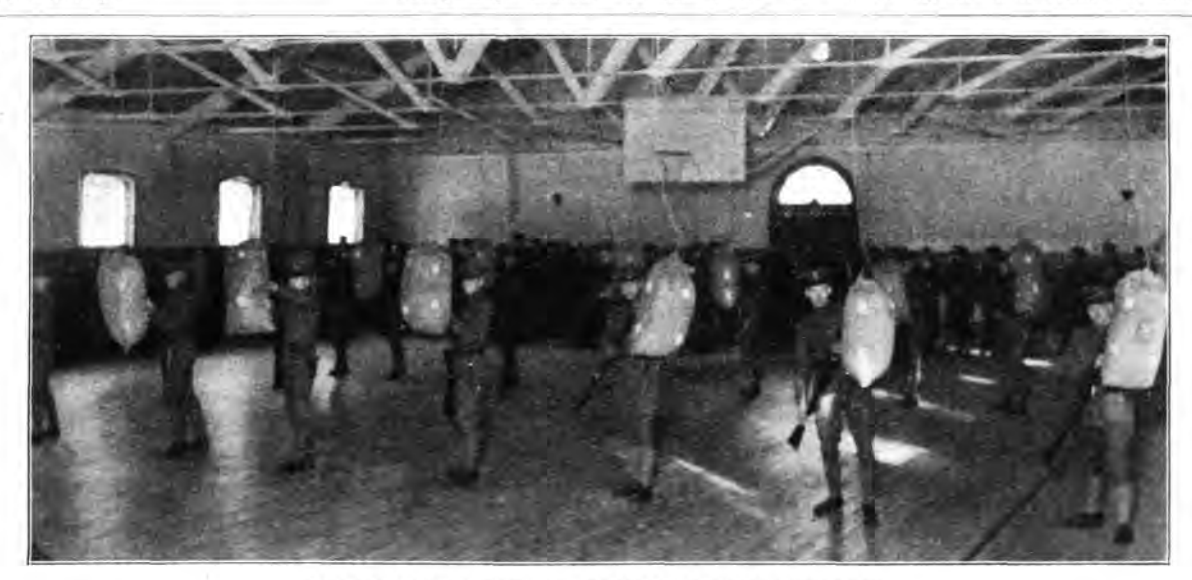
JABBING THE 'HUN' HORDES IN THE ARMORY.

The State Board of Agriculture, which governs the college, is properly made up of men from various busi-