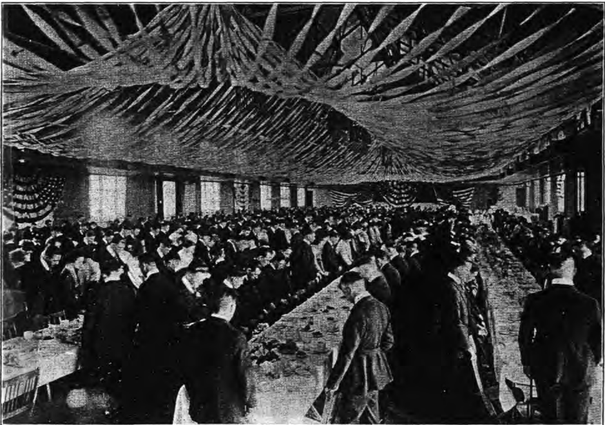
THE UNION BANQUET, HONORING M. A. C. SOLDIERS.

Share your news of fortunes and misfortunes with your fellow M. A. C. friends. Remember that there are nearly 2,500 RECORD readers, many of whom know you and will be glad to hear from you. Write the RECORD of any personal happenings that might interest them.