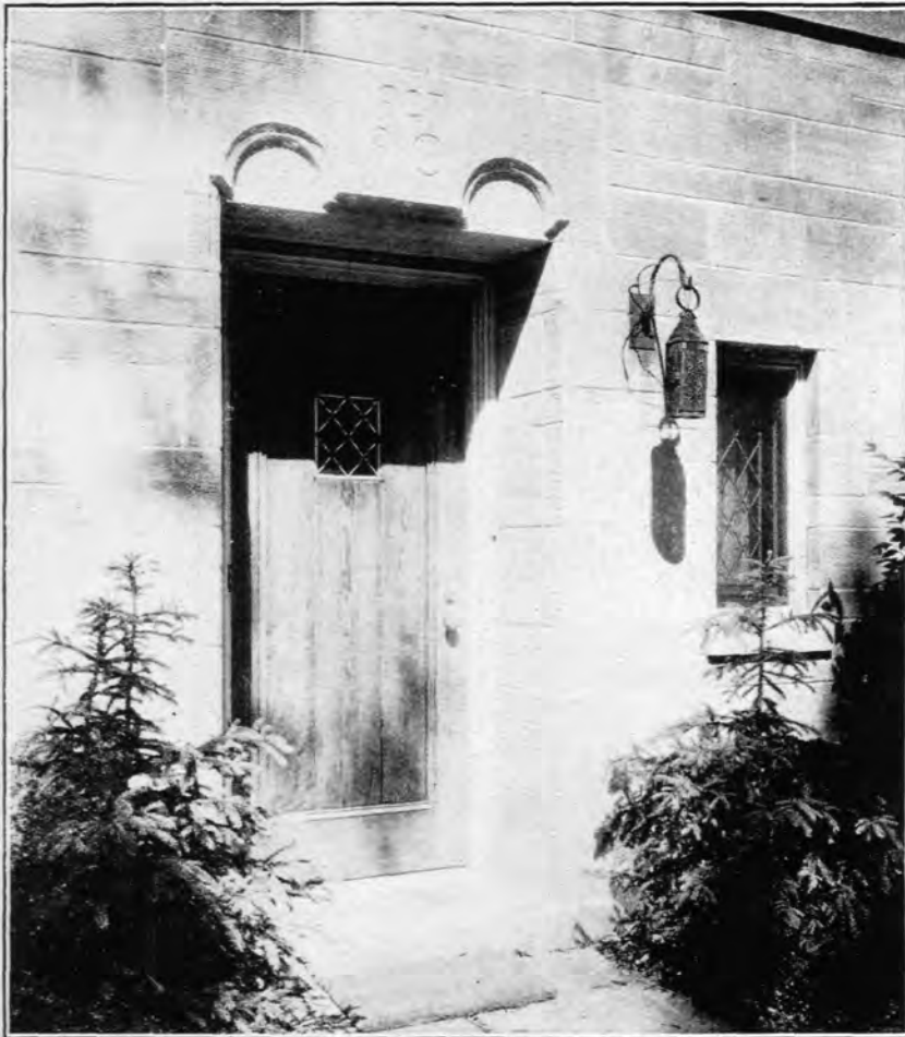
Entrance to residence, Lake Forest, Ill. Anderson & Ticknor, Architects

Let us tell you how you can have a house of beautiful Indiana Limestone for only 5% to 6% more than if some ordinary facing material were used