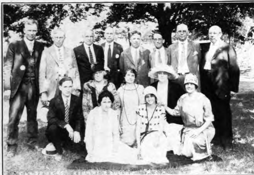
"Most favored" among visitors on the campus Alumni Day are those groups who come to attend some class reunion. Just five years ago the class of '95 gathered and were "snapped" as you see them above. The advance publicity indicates even a larger number of them here for the big event Saturday, June 21.