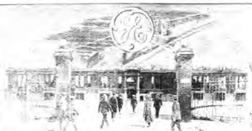
SCHENECTADY WORKS GENERAL ELECTRIC COMPANY