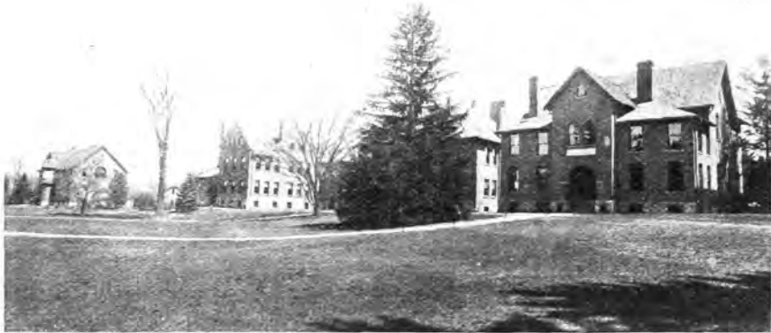
"Science Row." Looking North from the Veterinary Building. This is but one of the dear old familiar scenes that await Homecomers, Nov. 5.