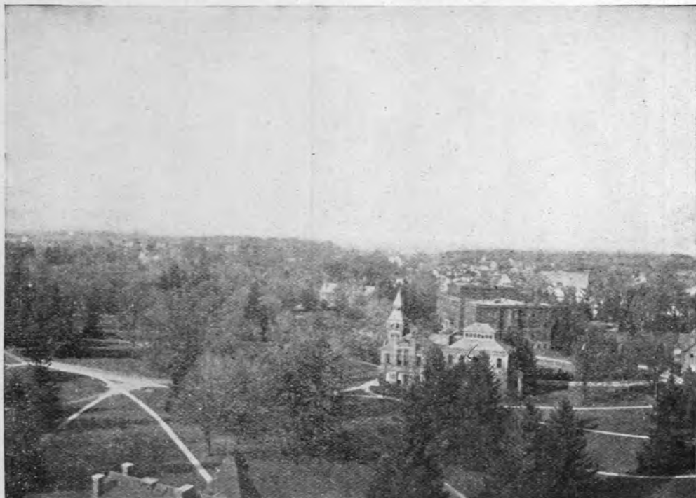
As the Library, Women's Building, and Howard Terrace Look from the Top of the Power House Stack.

The corner of the roof at the lower left is that of the old Veterinary Building.