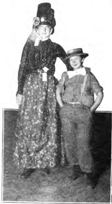
Co-Ed Prom Prize Winners.

Headliners among the speakers at the general meetings were Ex-Governor Frank O. Lowden, of Illinois, also president of the American Holstein-Friesian Association; and Governor Alex. J. Groesbeck, of Michigan.