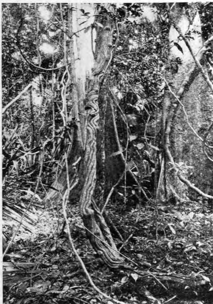
PHOTOGRAPHY MUST BE LIBERALLY EMPLOYED