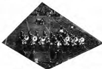
Band Parades for Homecoming Alumni

O UTSIDE of the game the main event in the Homecoming program was the testimonial banquet planned by the alumni varsity club and the alumni