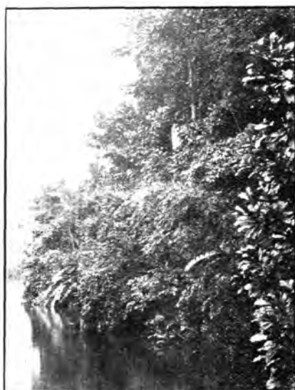
NO STANDING ROOM HERE