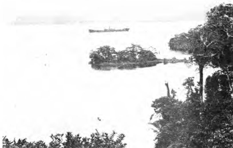
GOING AFIELD FOR PALMS

We went to Barro Colorado in the rainy season particularly to collect and