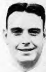
Smiling Jim Crowley was the main speaker at the annual "Football Bust" which was held at the Union, December 12. Details will appear in the January RECORD.

Attention was riveted on State in 1930, when the Spartans conquered Colgate, accepted champions of the east, and it was a hang-over from this triumph and the fact that they were playing a rugged schedule that brought them to attention throughout the campaign this year.