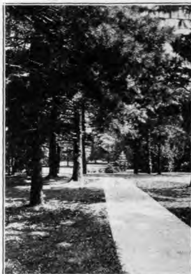
STATELY CAMPUS MONARCHS

Not only did I study plants while on the farm, but animals as well. Three years ago, on my birthday, the fifth of July, Dad and I were overhauling the cultivator preparatory to cultivating corn, when we heard the dog barking in the barn. We investigated, and found the dog worrying a tiny, frightened skunk in one corner of the haymow. It had not perfumed the dog, and Dad said he thought it was too young to have bad habits, so I picked it up in my arms to take to the house to show Mother and the children. It was scared motionless, and even permitted the children to pet it without moving. As I was carrying it back to the barn, Mother came out on the porch and called to me to put it down on the ground in order that my little brother and sisters might see its queer, waddling walk. I did, and