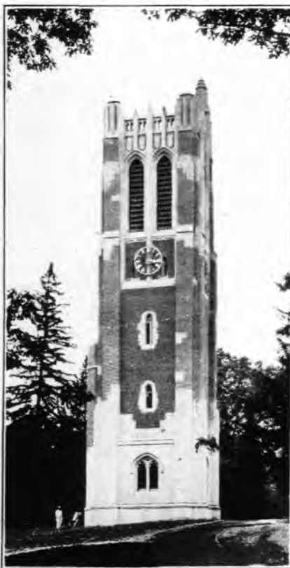
BEAUMONT MEMORIAL TOWER

At last the radio was finished, but I had no headphones to use with it. I myself did not believe it would work, so I hesitated at buying the expensive 'phones. I expressed my trouble to the manager of Henkel's Radio shop, and he said I could work for him until I had earned a headset. He gave it to me late one Saturday night, and I hurried home with joy in my heart as I clasped the set under my arm.