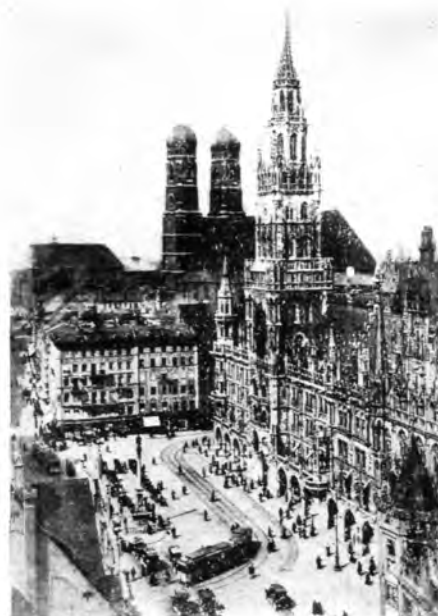
—Munich, Germany: Music Lovers, Art Psychology, Education Study and Social Welfare Tours will spend some time in this charming capital of the scenic Bavarian Highlands. (To the right)