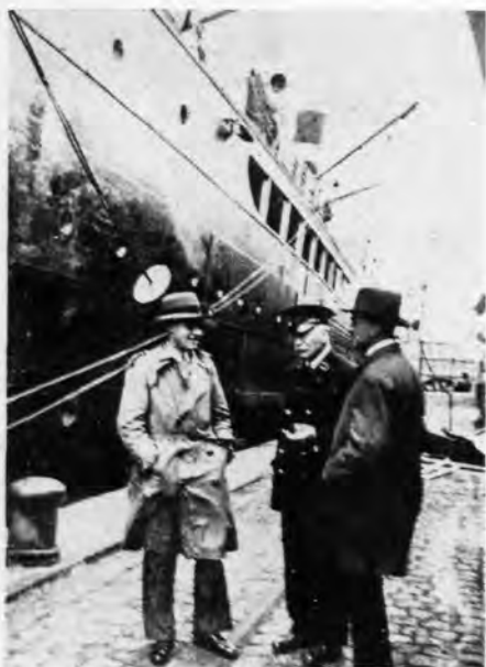
—college men and women will be assisted on their travels by American Express interpreters stationed at piers, depots and frontier points. (To the left)