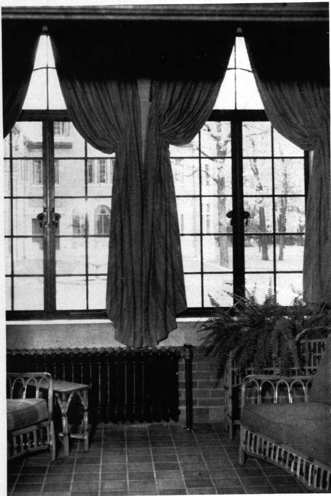
LOUNGE VIEW WEST MARY MAYO