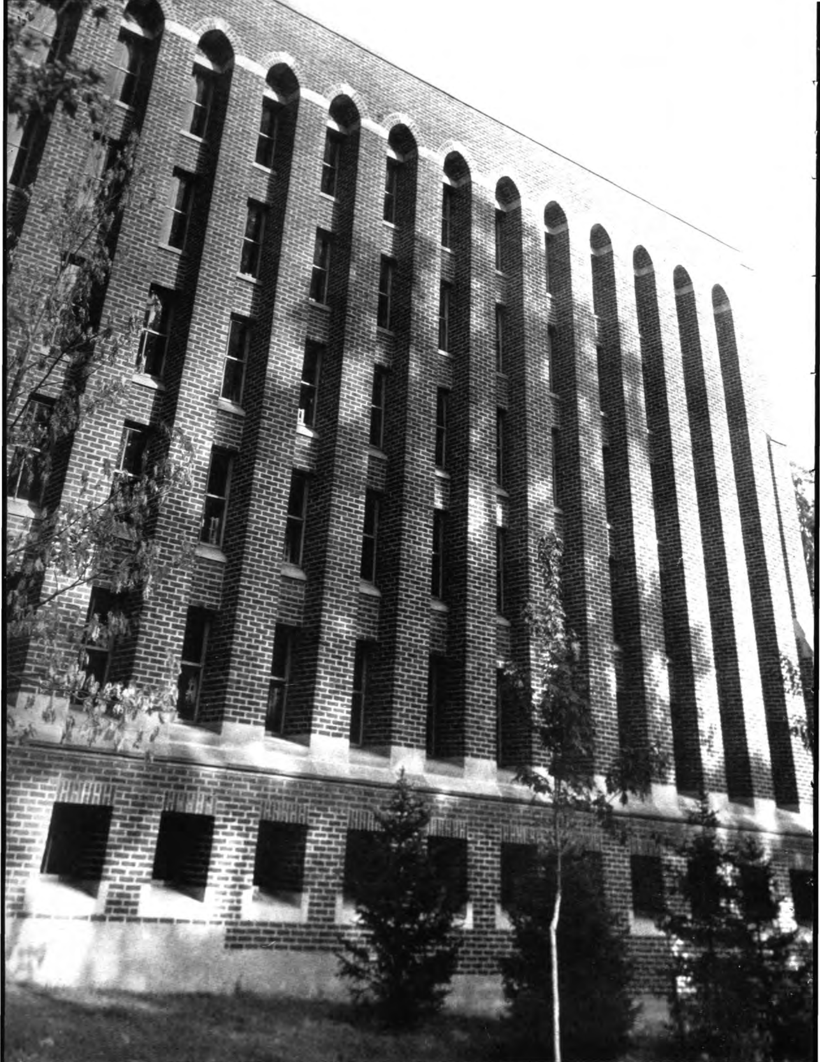
SUN PEEPS IN ON LIBRARY STACKS