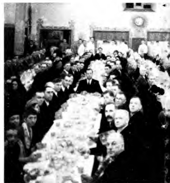
A Farmers' Week highlight . . . the annual livestock ba speakers . . . college honors project winners . . . one o during the week.