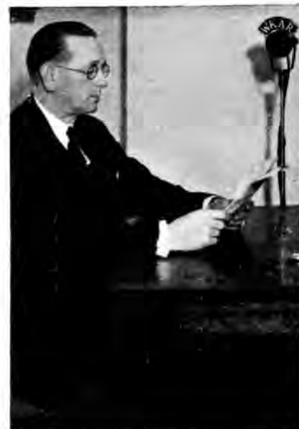
Governor Frank D. Fitzgerald

The second title of the act provides for "the further development of co-operative agricultural extension work under the terms of the Smith-Lever Act of 1914. Funds for extension purposes are to be divided among the states in the proportion that the farm population of each bears to the farm population of all the states. The allotment of funds to Michigan for the present fiscal year is $199,451.59. The act does not require that this fund be offset by state funds