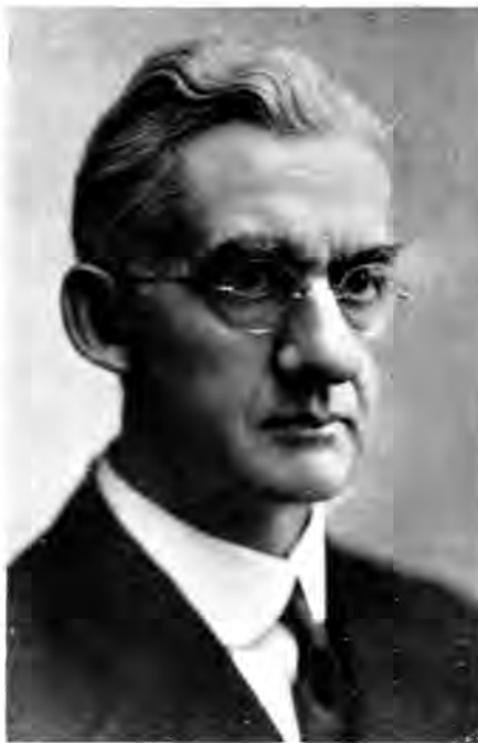
President R. S. Shaw

Michigan State College, like all other similar institutions of the land grant class, has three basic functions, namely, education, research and extension. The relationship of these three activities may be illustrated by the division of the 1934-35 budget, which totaled $2,157,212 and was allocated as follows: for educational activities, $1,387,412 or 65 per cent; for Agricultural and Home Economics Extension, $413,238 or 20 per cent; and for research, $356,561 or 15 per cent. In 1934-35 the resident teaching staff numbered 309, extension staff, 137, and the Experiment Station staff, 125, totaling in all, 480.