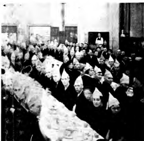
banquet . . . stock producers exchange ideas . . . hear noted one of the many other affairs held at Michigan State College

Week's Program For Rural Residents The Farmer As An Individualist Is Various Meetings . . . . .