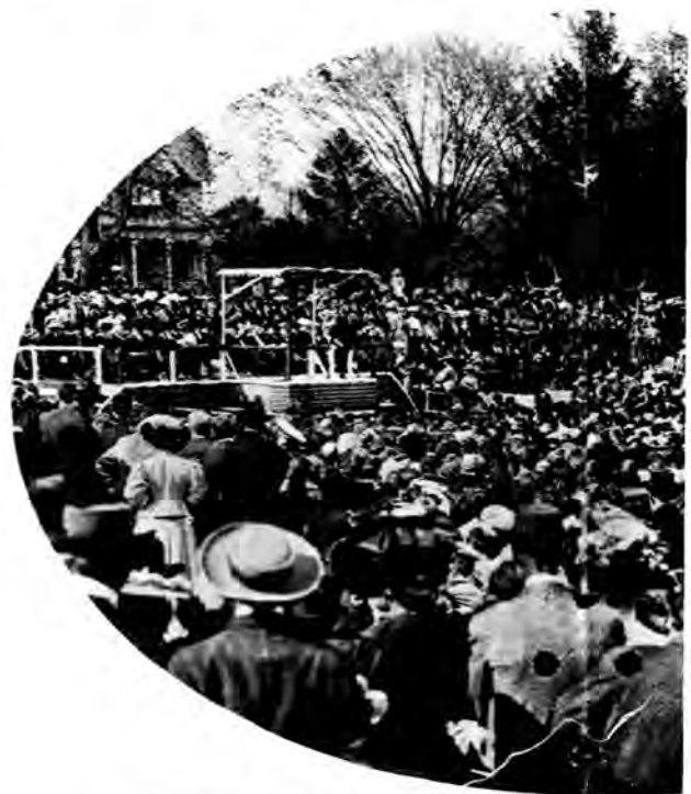
President Theodore Roosevelt delivers comm 1907. Previous to his talk he planted the