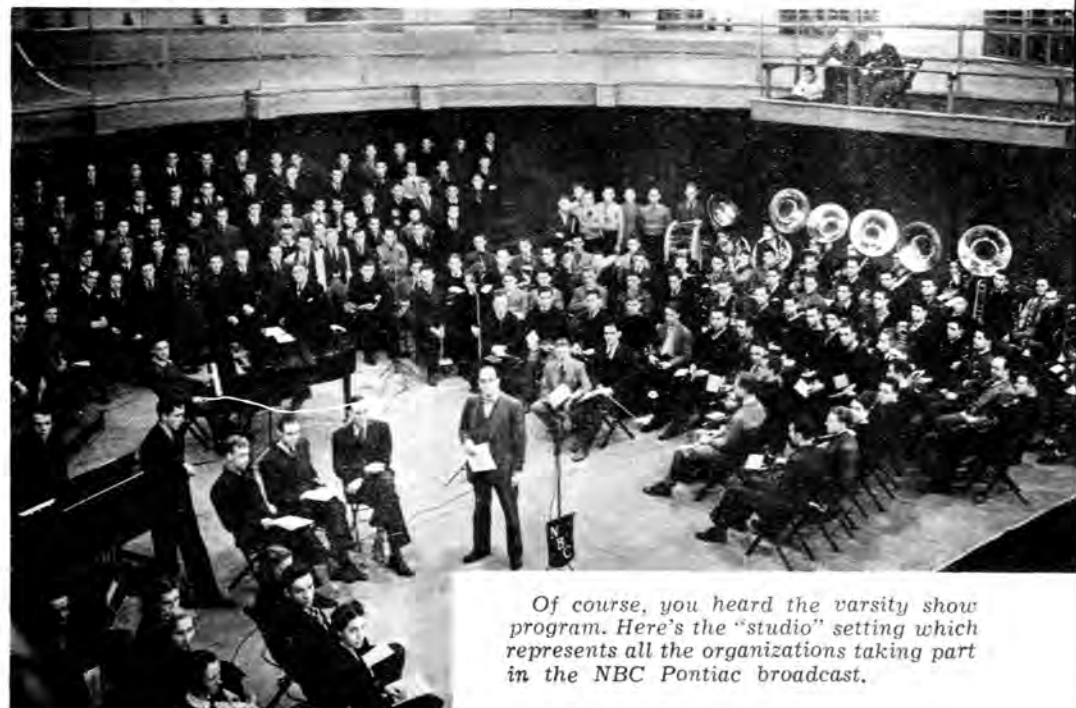
Of course, you heard the varsity show program. Here's the "studio" setting which represents all the organizations taking part in the NBC Pontiac broadcast.