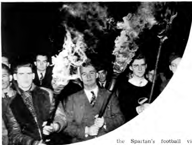
Night before homecoming when pep reigned supreme.

T WAS a homecoming I'll never forget," said a member of the class of '07 as he was leaving East Lansing at the close of this year's annual celebration for returning alumni.