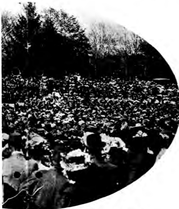
President Roosevelt delivers commencement address to class of 1907 as he planted the famous Huntington Elm.

Below: Plaque on stone commemorating the planting of the famous elm.