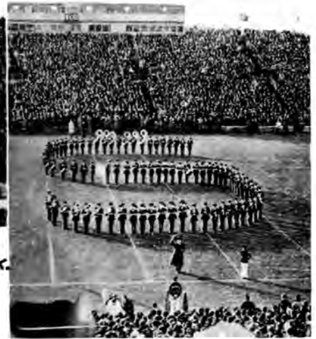
Band on parade

The Wayne game was watched closely by all interested. In this game it became evident that the Spartans had a line capable of holding its own and some backs who were sure to produce results in later games. State won from the Detroit team, 19 to 0. The showing was not too startling but the following week at Ann Arbor the team scored a 19-14 victory over the University in a manner that left no doubt as to which was the superior squad. A tendency to score in the last half has prevailed in