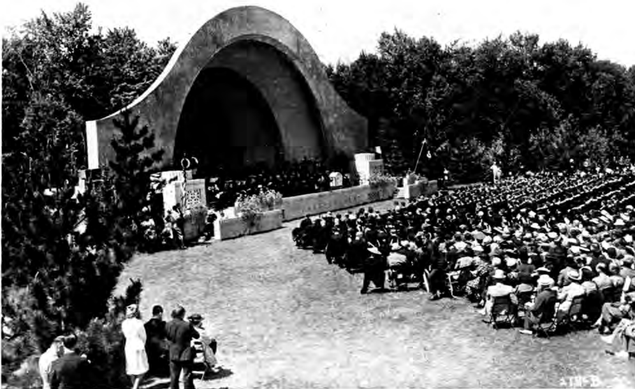
The Band Shell, which represents the gift of the Class of 1937. Here many college organizations presented programs for the enjoyment of students and friends following its completion last spring. Commencement Day would be a fitting caption for the above view. A very small section of the 6,000 people who witnessed the event can be seen.