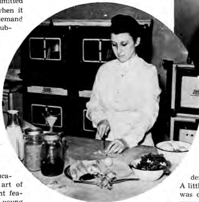
In the laboratory women combine theory with practice in preparation for varied types of careers

course and social life of women students. During her administration the first bachelor of science degrees with a major in Home