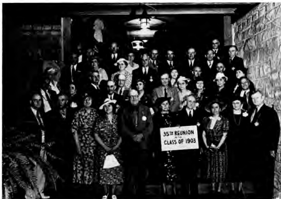
It's the class of 1903 who returned to the campus in large numbers to renew old acquaintances.