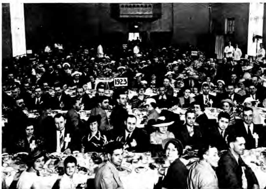
Many reunion groups are represented in this picture. In the foreground you see the class of 1923. In the background you can see the classes of '08, '18, and '28.