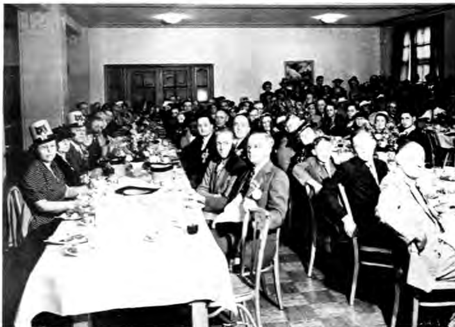
You guessed it—they did have fun, the class of 1913.