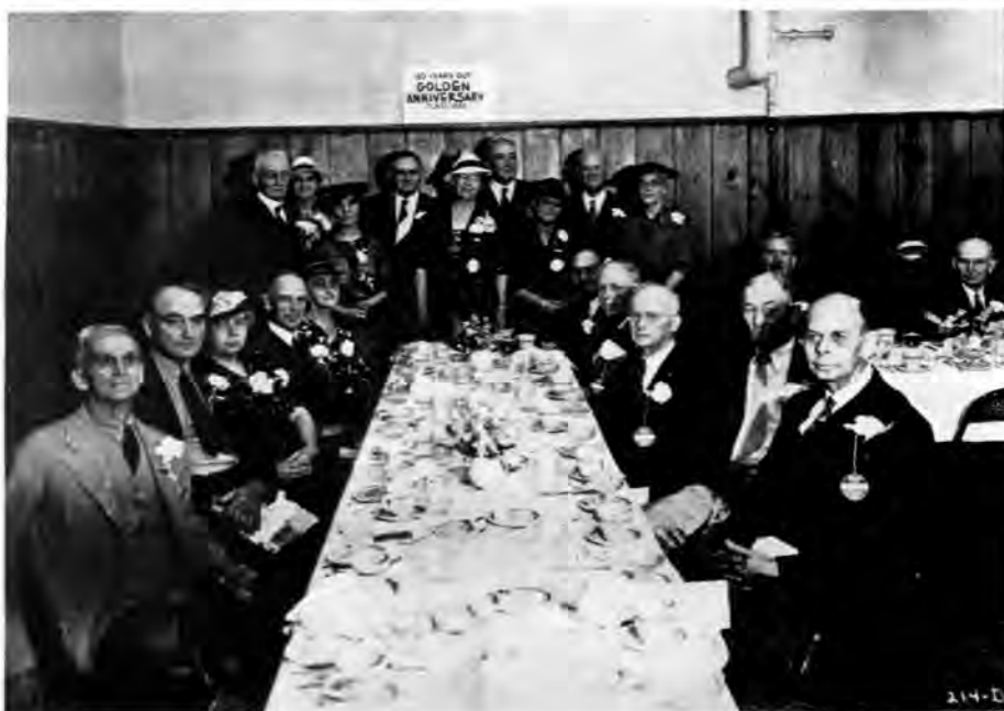
These men and women celebrated their golden anniversary, having graduated from the college 50 years ago. The picture was taken at their luncheon on alumni day.