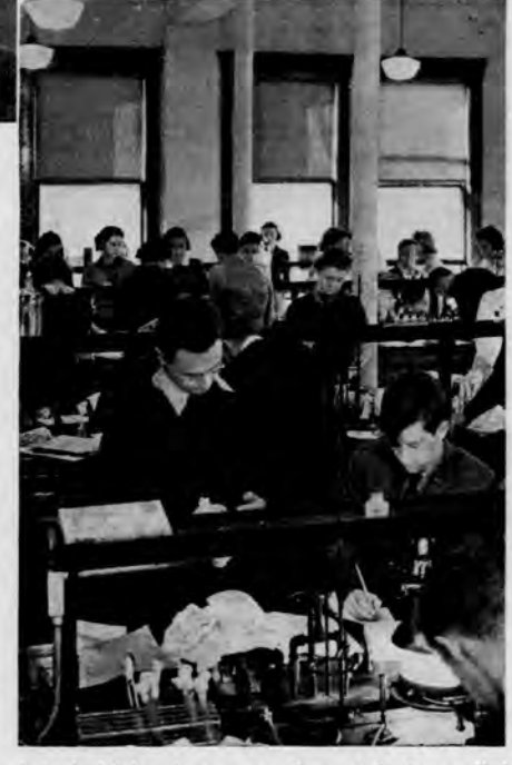
A typical laboratory scene where students enrolled in veterinary science learn "why" through experimentation.

AT first the course was like the other college courses, one of four years. In 1935 the Board authorized an increase in the requirements for entering into the veterinary curriculum by adding