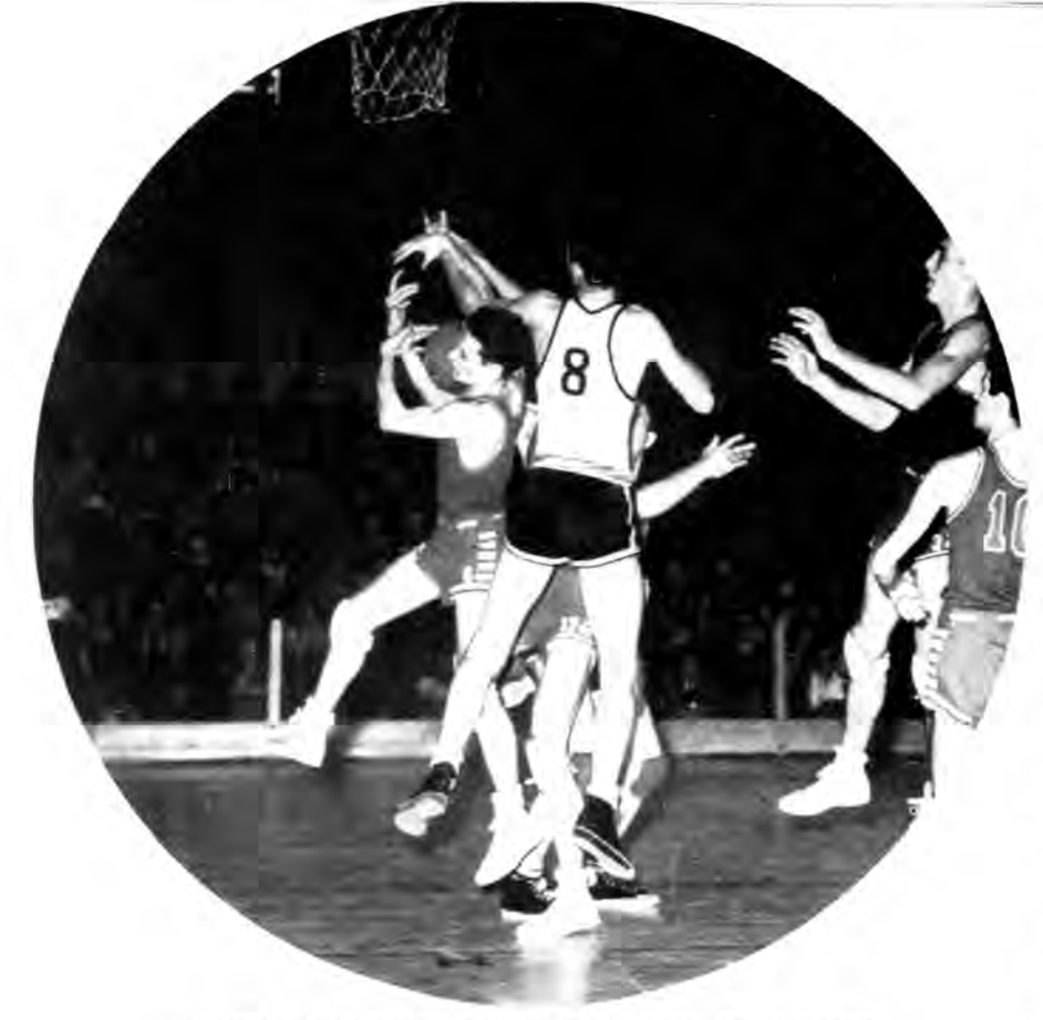
Caught on the rebound! It was Temple vs. State. The game ended, 23-22. in State's favor, but not until the last five seconds of playing.