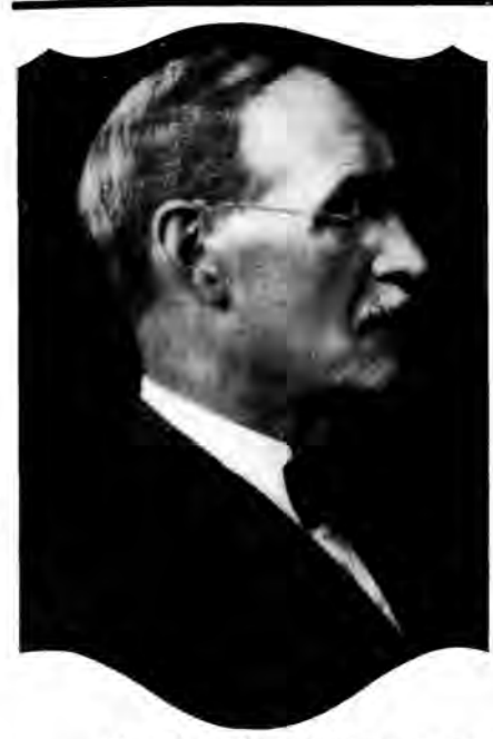
... Alumni considered him a campus institution.