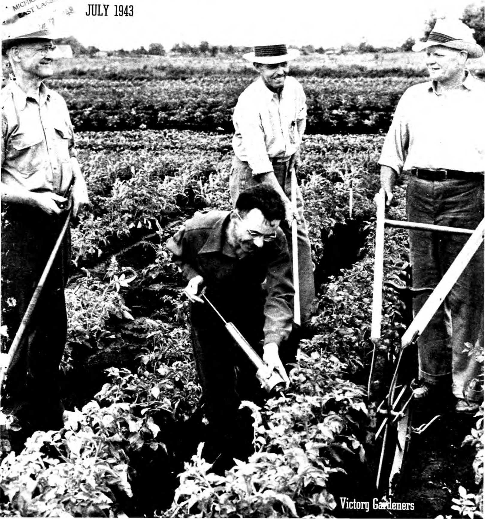
◆ Victory Gardeners