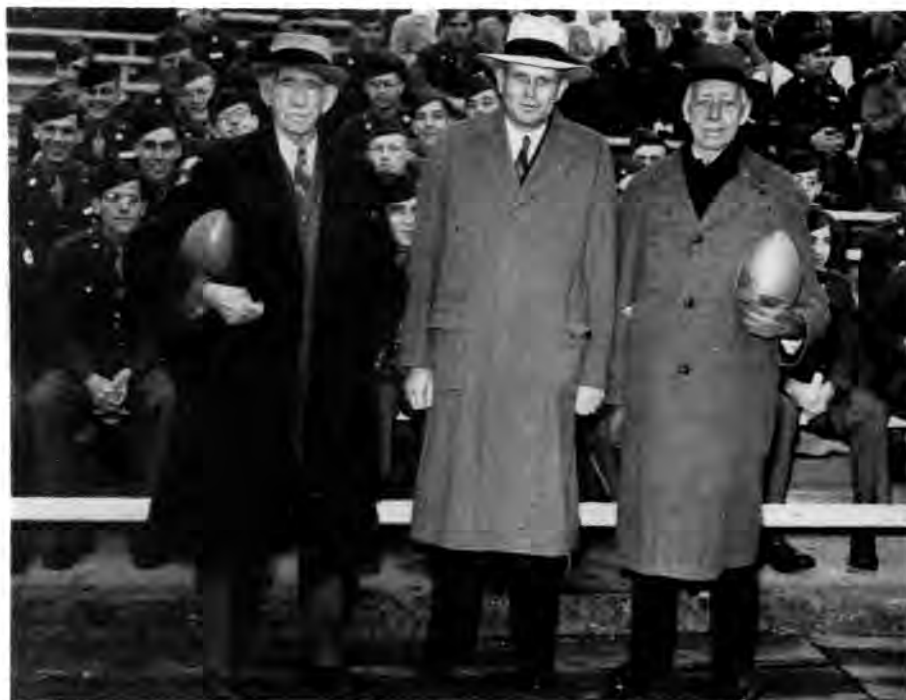
... they saw a Campus at War

Two men who played on the first football team at Michigan State College 60 years ago took part in the opening this fall of the campus football league on Macklin Field.