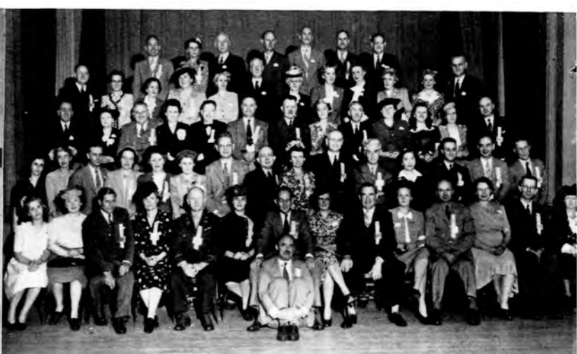
These men and women of the classes of 1918 and 1919 returned on Alumni Day, June 10, to celebrate together their silver anniversaries.