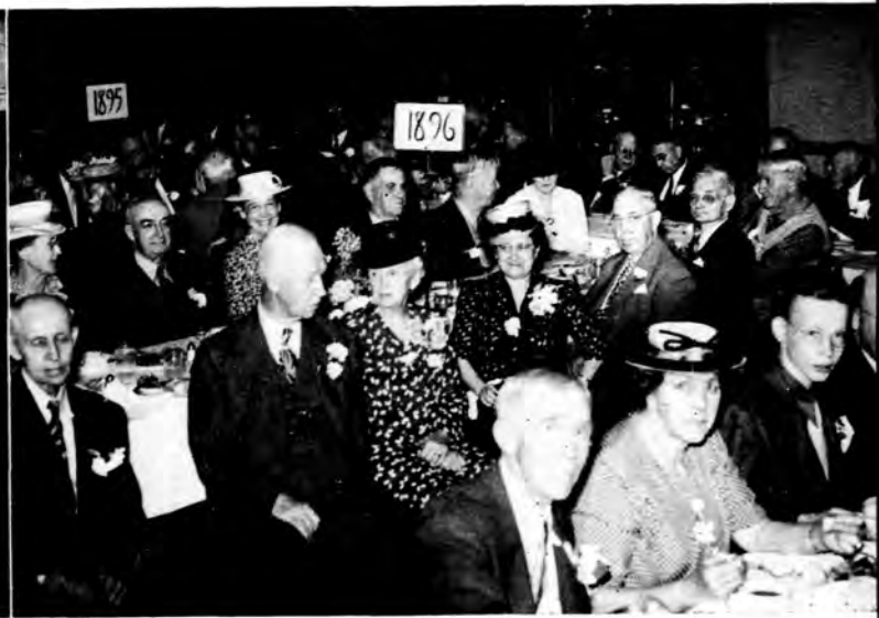
The class of '96 joined the Patriarchs' club at the Saturday noon luncheon. In the background are the '95 and speakers' tables.