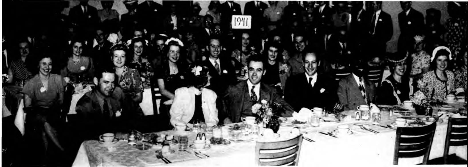
The class of 1941 was the youngest group holding a special reunion luncheon.