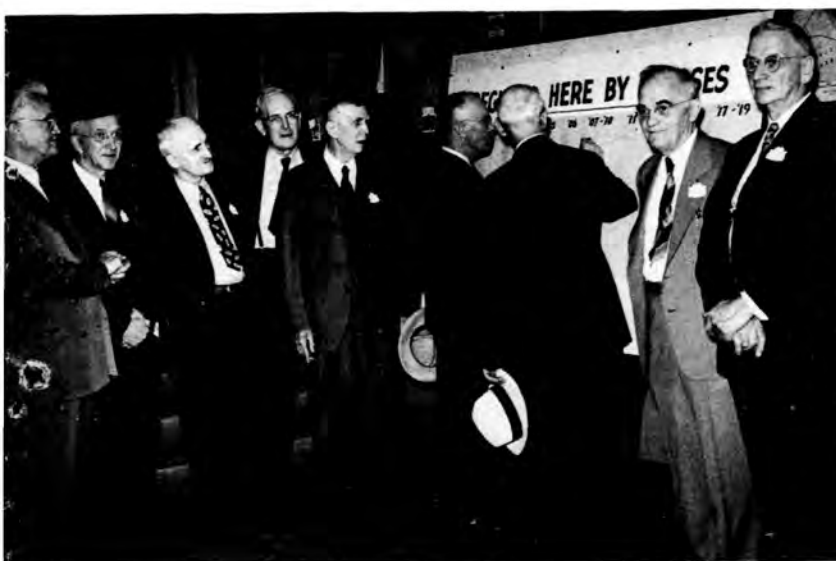
Some of the old-timers met as they checked the registration board in the Union lobby to see "Who's back?" Most of this group came from '06.