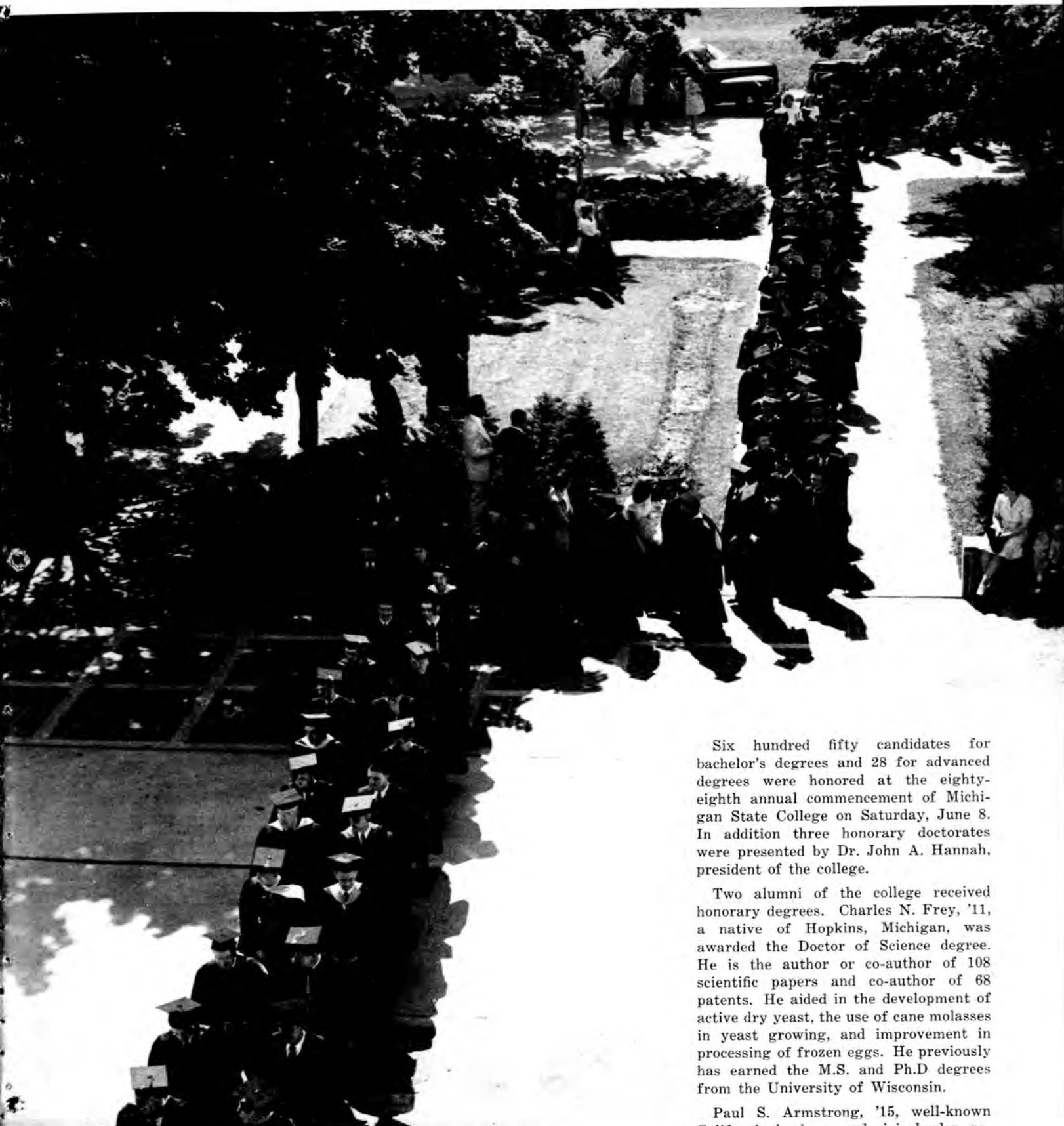
Commencement Parade, 1946, approaches College Auditorium.