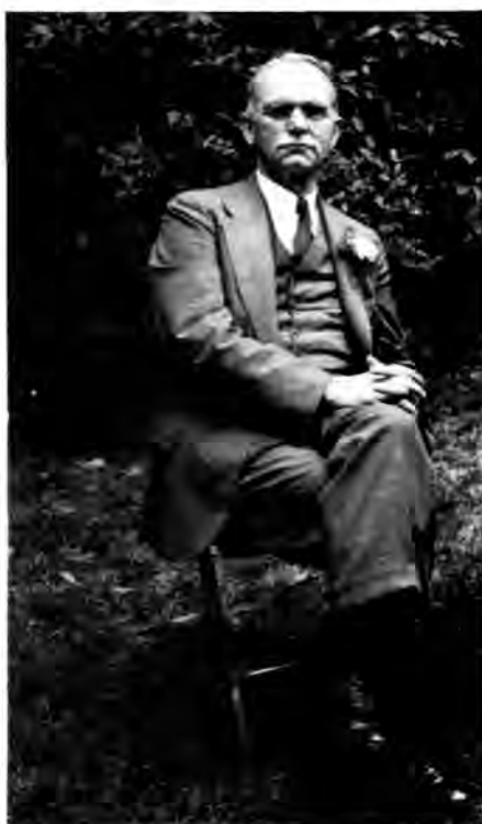
Ray Stannard Baker, '89, is pictured here on his last visit to the campus of Michigan State College in June, 1939, when he returned to celebrate the 50th anniversary of his class.

He joined the reportorial staff of the Chicago Record in 1892 and became widely known as a liberal journalist. He became an associate editor of McClure's