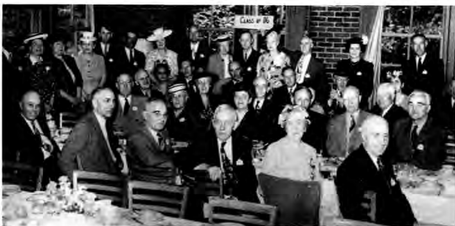
The class of 1906 had a large group on hand for its fortieth, and began making plans for the fiftieth in 1956.