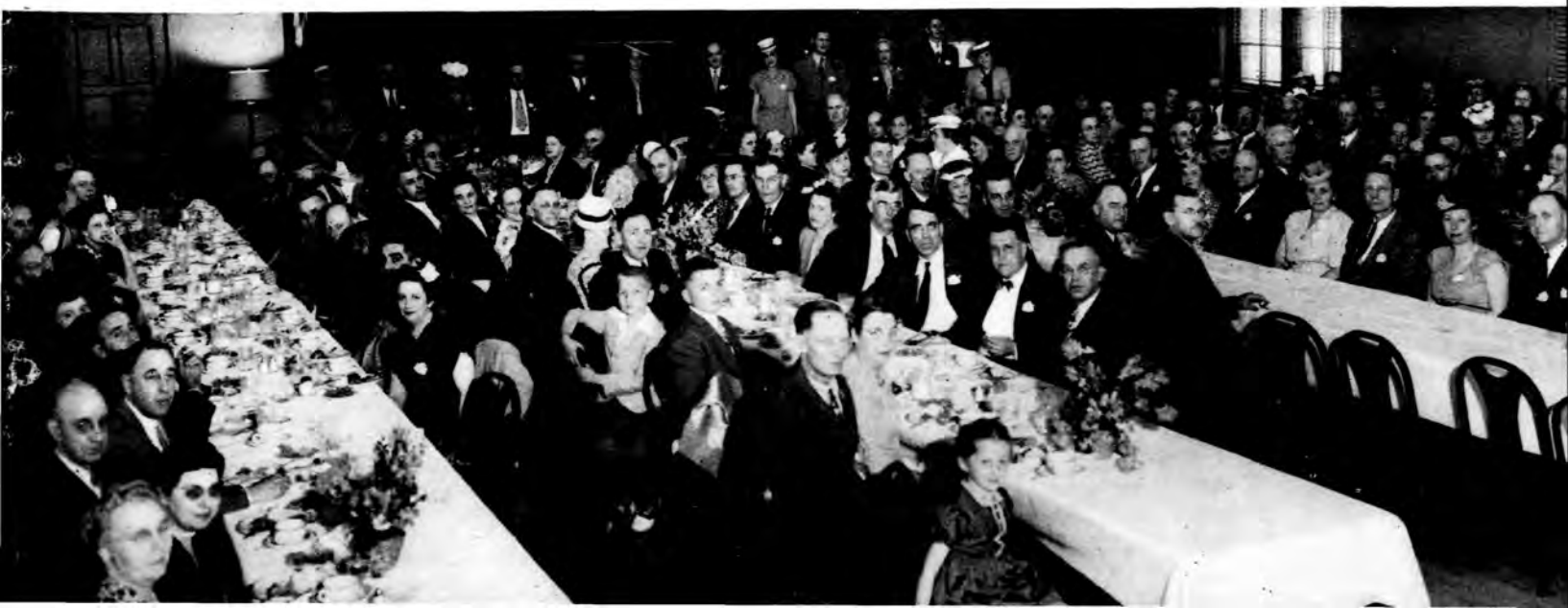
The classes of '20 and '21 joined for their silver anniversary Friday night.