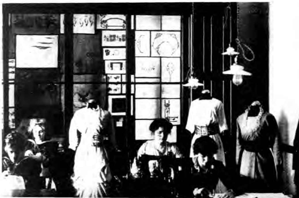
An early sewing class (1908) hard at work.

"The second term in this work will be devoted to simple cutting by the Vienna Ladies' Tailoring System, one of the latest systems. The third term will include both cutting and fitting. No sewing machines are used at present, but