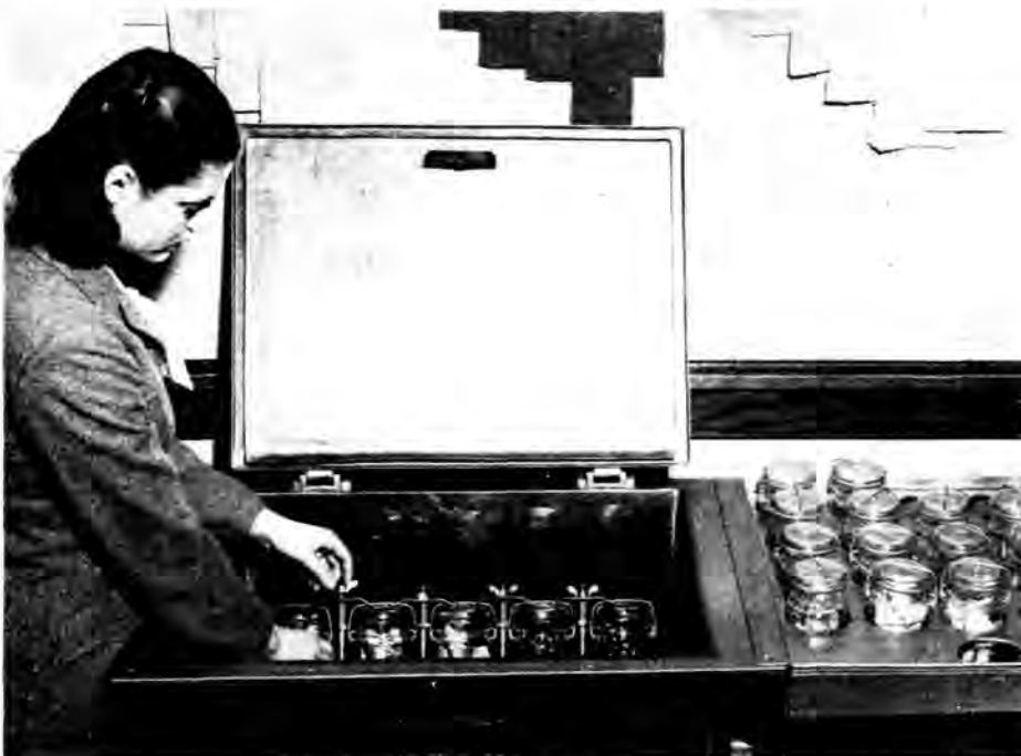
A student doing modern research on textiles.

Young women trained in nutrition may serve as consultants, advisers, and teachers in both private and public agencies. Hospitals seek dietitians for their staffs, who may do either administrative, therapeutic or clinic work. The American Dietetic association has set up standards