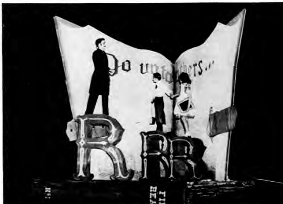
Winning Water Carnival float was Delta Sigma Phi's "School Days."

Eleven new buildings providing a total of 93 new classrooms and 96 offices for departmental use will be available for use at the opening of school in September. The group of temporary structures is located on the south side of the Red Cedar river, extending from just south of the river road to the vicinity of the stock judging pavilion. A foot bridge is being built near the forestry cabin to make the new buildings easily accessible.