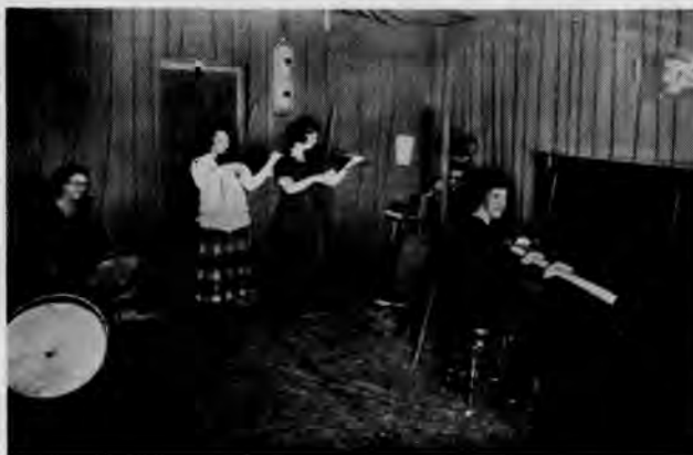
Studio Scene About 1925

Through the next few years the college station went through a rather hectic period. Its channel was frequently changed, as were its power and the hours it was permitted to broadcast. Through it all the attempts to broadcast farm service programs were continued, and the groundwork was laid for WKAR's development as an outstanding public