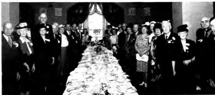
Freshmen Patriarchs of 1897.