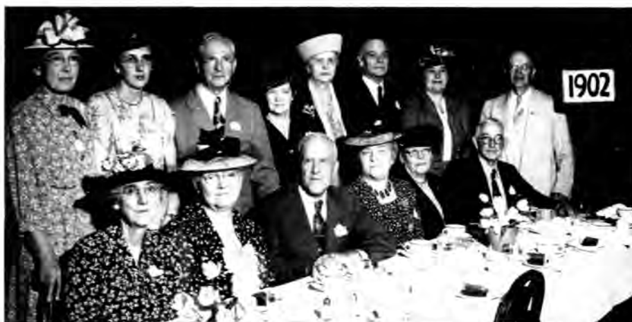
The Class of 1902 At Its Luncheon.

The officers and executive committee of the Washington, D. C., club notified the alumni office that because of the late-