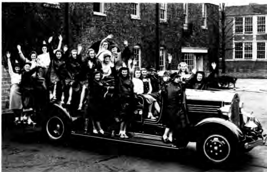
What town wouldn't like a fire department that looked like this? The lucky town is Marshall, Mich., but the girls, of course, aren't really members of the town fire fighting unit. They're Michigan State College co-eds on the community study project at Marshall. One of their more pleasant chores is to get acquainted with fire department functioning and even go for an occasional ride on the big red truck.

"It may be that if the four-year colleges are relieved to some extent of the necessity for educating some of the masses of freshmen and sophomores who seem likely to enroll in colleges in the future, it will be possible to improve the quality of instruction in the upper schools."