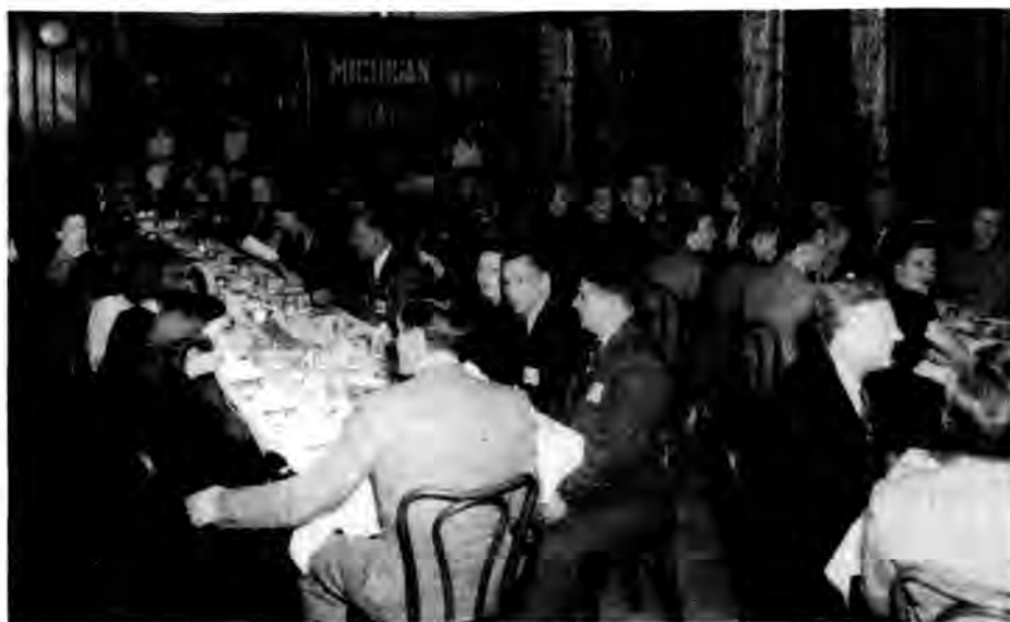
Michigan State College graduates and former students from Arenac, Gladwin, Iosco and Ogemaw counties had a successful reunion in Standish January 15. More than 70 persons attended the get-together in the Trading Post restaurant.