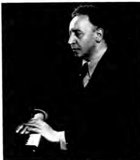
ARTHUR RUBINSTEIN: For students, a wealth of culture.

Now, with the completion of the new Robert S. Shaw men's hall, administra-