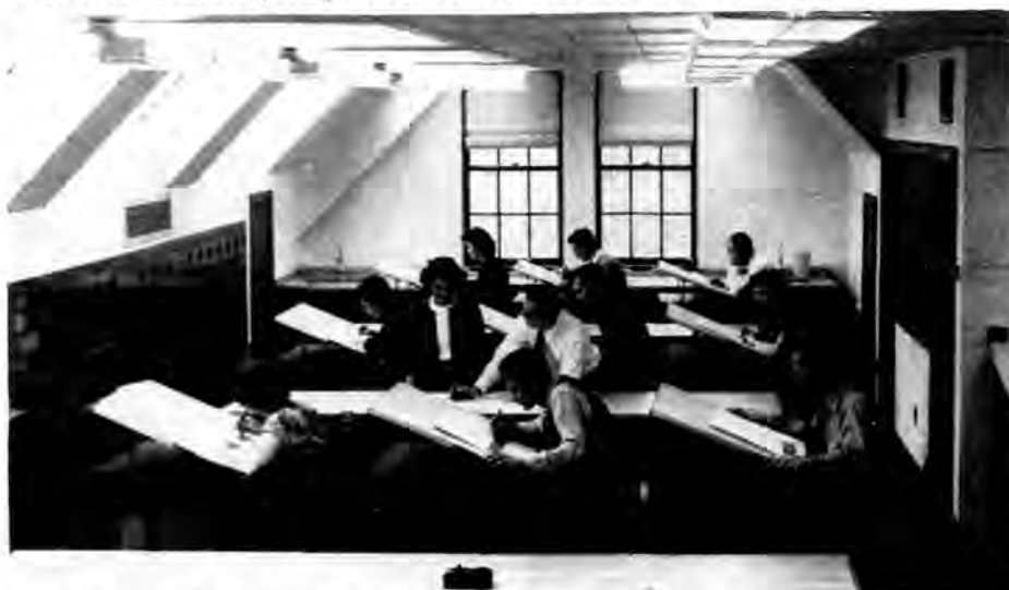
LAYOUT FOR MAPPING: MSC students learn basic techniques of cartography in the naturally lighted map-room of the new Natural Science building.