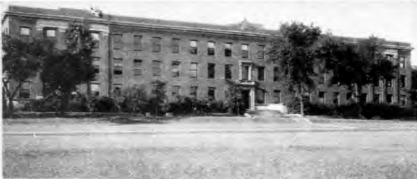
Bessey Hall, University of Nebraska