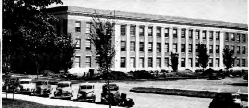
Burnett Hall, University of Nebraska