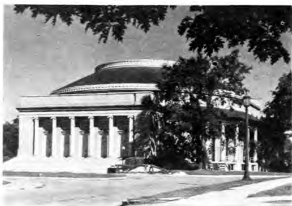
Bailey Hall, Cornell University

Many alumni have carried the spirit of Michigan State to other colleges and universities. A measure of the prestige which they enjoyed appear in the buildings named for them. On this page are shown a few of these memorials. The editors would welcome similar pictures.