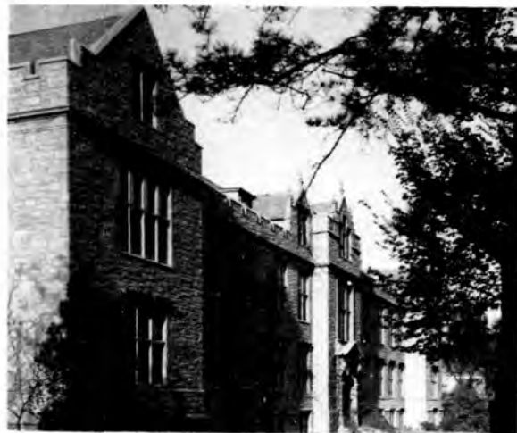
Mumford Hall, University of Missouri