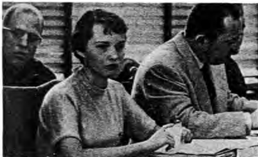
and the British defend French colonial policy.