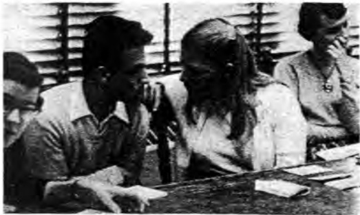
while the U.S.S.R. plans its strategy . . .