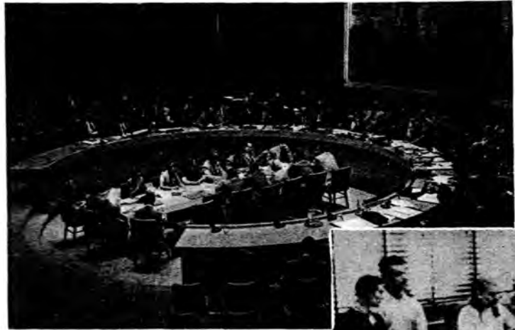
Norway design decorated the S at the United N headquarters in

But in a more simple setting provided by M.S.C. the issues, procedures and atmosphere of intense interest are the same.