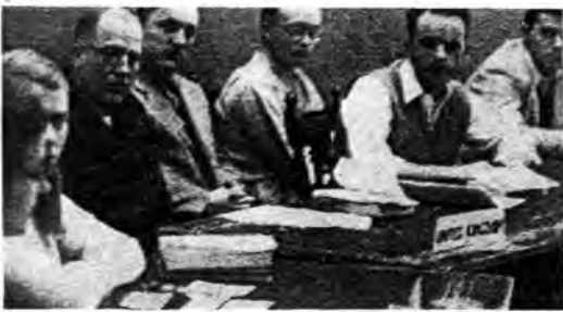
Pakistan speaks for the Tunisian cause . . .